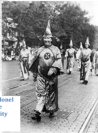
Wherever the Klan rode, lynching parties and riots flourished.