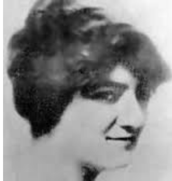
Madge Oberholtzer. Her brutal rape and murder tarnished the Ku Klux Klan.