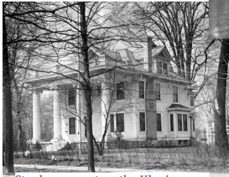
Stephenson set up the Klan's Imperial Palace of the North in Irvington, a fine old Indianapolis neighborhood.