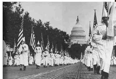
It would be the pinnacle of power for the 1920s Ku Klux Klan.