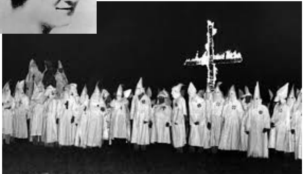
Secret, anonymous, hooded klaverns, and their fiery crosses swept the nation in the 1920s.