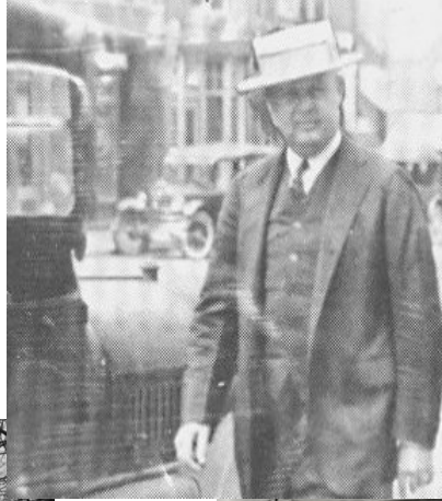
Stephenson cleverly used modern sales techniques and trickery to build a Klan political empire in Indiana and became a millionaire on Klan dues and the markup on the sale of sheets.