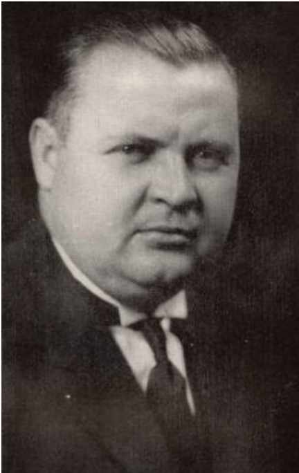
David Curtis Stephenson created a political empire from the 1920s KKK, capturing law enforcement, the church, and the Republican party. He planned to be President.

Here are some of the faces and events of the cast of characters in UNMASKED! The Rise & Fall of the 1920s Ku Klux Klan .