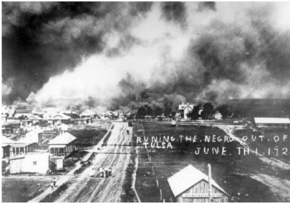
The Klan used the infamous 1921 Tulsa race riot as a recruiting tool.