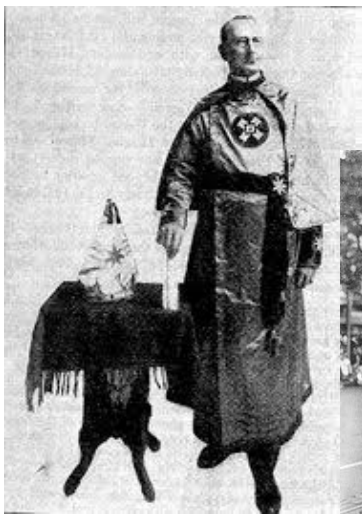
A dreamy, bigoted idealist, Colonel William Simmons, created the 1920s Klan as a secret fraternity but...